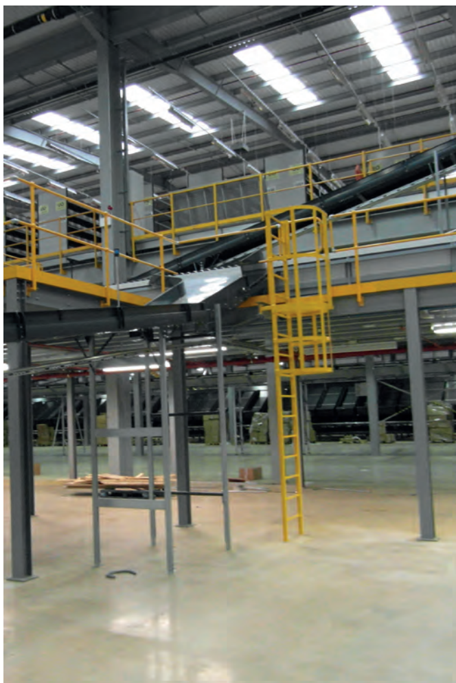
VERTICAL ESCAPE LADDER

Vertical Escape Ladders provide both a fire exit route and access for routine maintenance work where space is restricted.