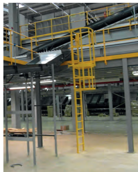
VERTICAL ESCAPE LADDER