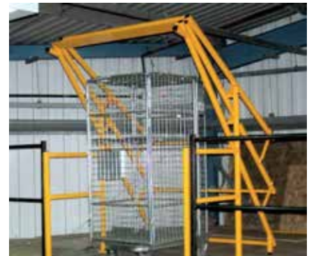
TYPE 3, 4 & 5