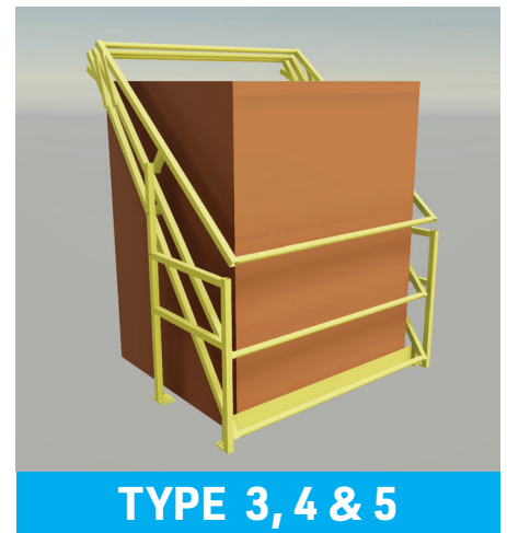
TYPE 3, 4 & 5